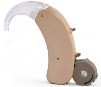
RENATA ZA675.DMP6 0%Hg HEARING - 1,4V