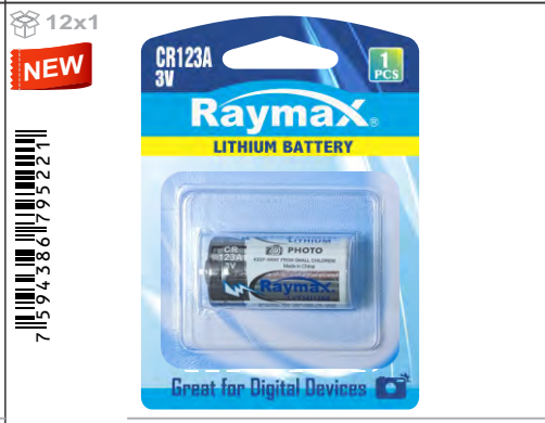
RAYMAX Lithium - CR123A - 3V