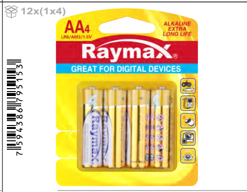
RAYMAX Alkaline - LR6 - AA x4