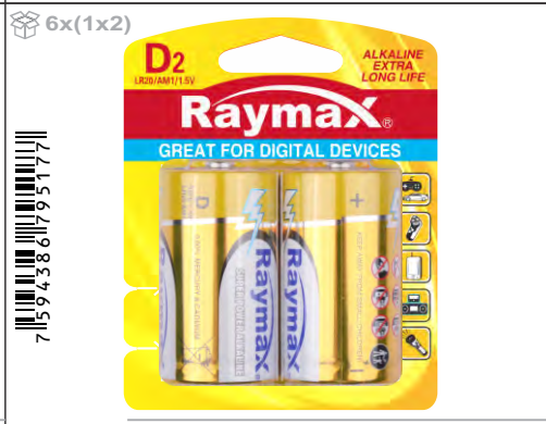
RAYMAX Alkaline - LR20 - D x2