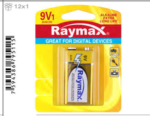
RAYMAX Alkaline - 6LR61 - 9V