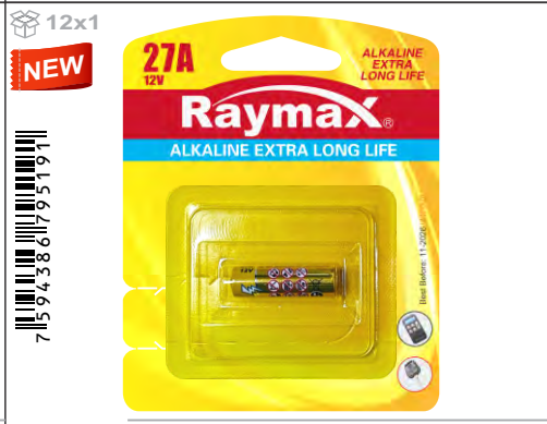
RAYMAX Alkaline - 27A - 12V