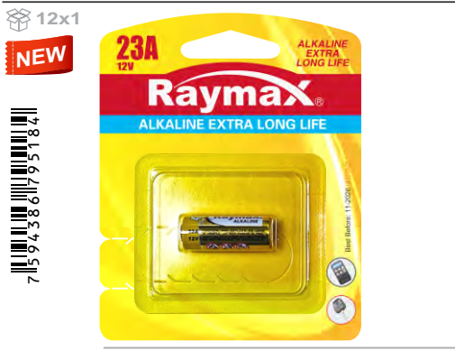
RAYMAX Alkaline - 23A - 12V