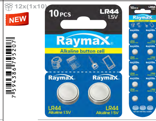
RAYMAX Alkaline - LR44 - 1,5V - 10pcs