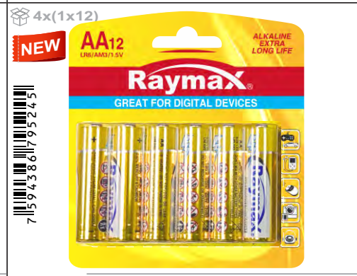
RAYMAX Alkaline - LR6 - AA x12