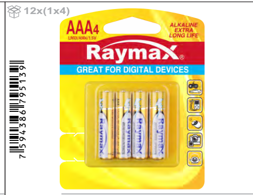
RAYMAX Alkaline - LR03 - AAA x4