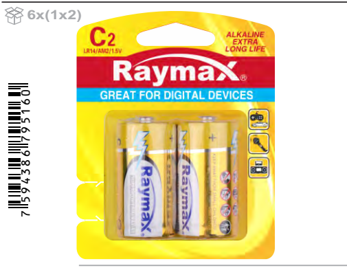
RAYMAX Alkaline - LR14 - C x2