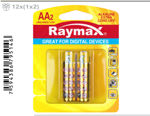
RAYMAX Alkaline - LR6 - AA x2