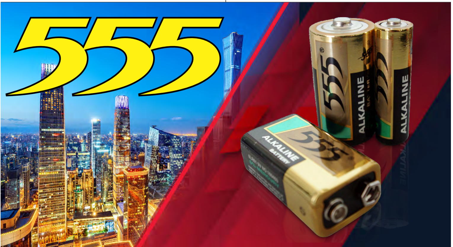
555 Alkaline - LR1 - D x6