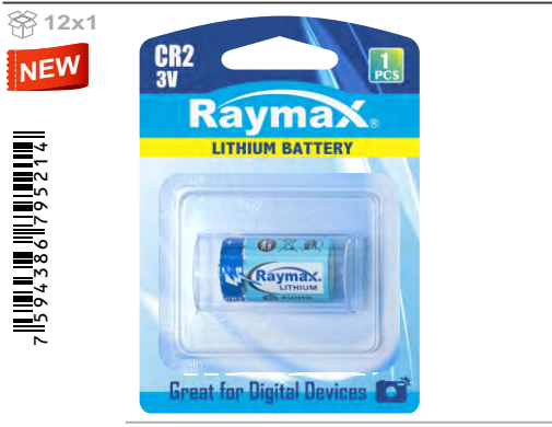
RAYMAX Lithium - CR2 - 3V