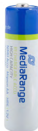
MediaRange 2.600mAh Rech. AAx2 -1.2V