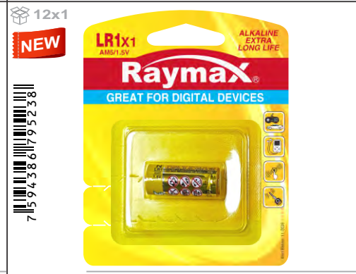
RAYMAX Alkaline - LR1 - 1,5V