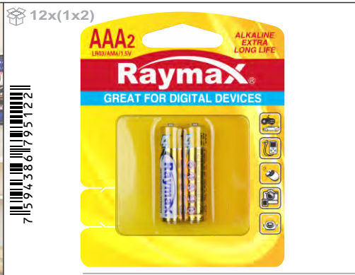
RAYMAX Alkaline - LR03 - AAA x2